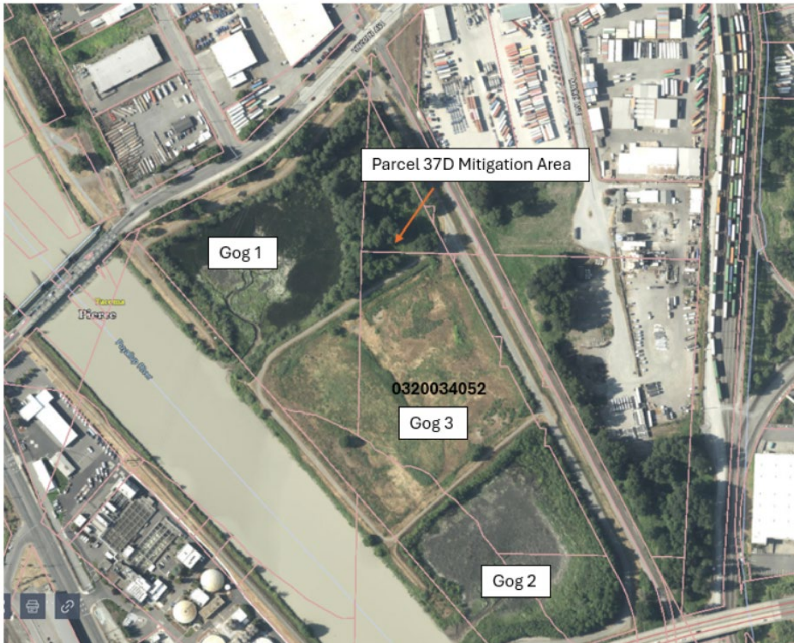
Figure 3. Parcel 37D Mitigation Area and proposed Conservation Easement parcel